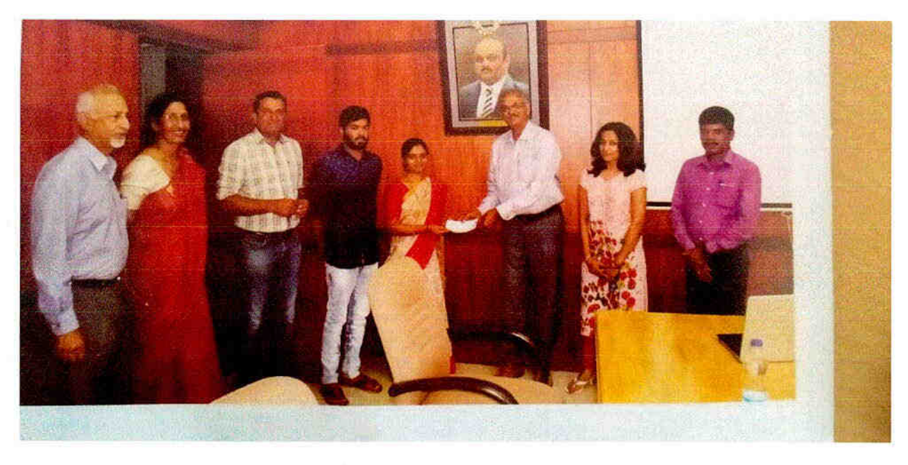
Extending financial help to flood affected students

Website: www.citcoorg.edu.in | Email: info@citcoorg.edu.in