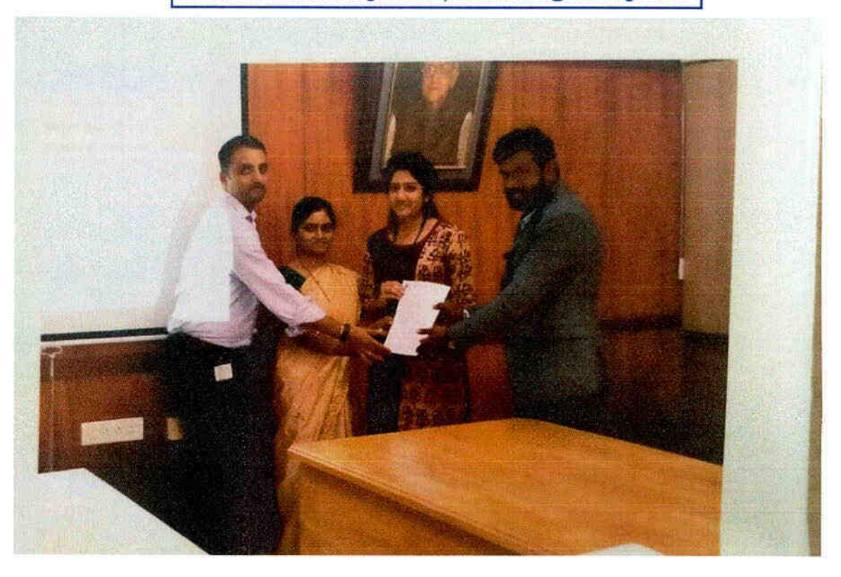
Student Receiving scholarship

Website: www.citcoorg.edu.in | Email: info@citcoorg.edu.in