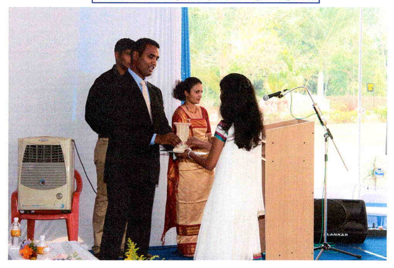
Endowment prize distribution on college day

Website: www.citcoorg.edu.in | Email: info@citcoorg.edu.in