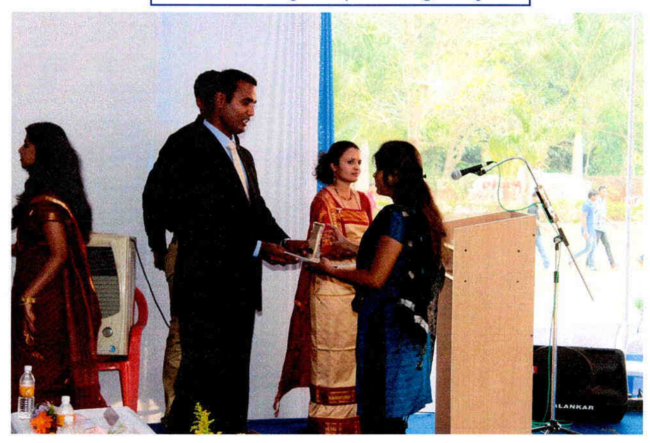
Endowment prize distribution on college day

Website: www.citcoorg.edu.in | Email: info@citcoorg.edu.in